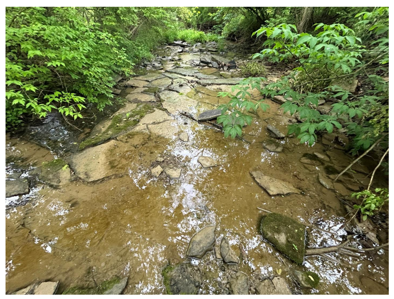
Figure 2. Limestone bedrock exposed in base of Willow Creek downstream of bridge

Our Mr. William T. Basich, PE, visited the project site on May 14, 2024. Mr. Basich observed that limestone bedrock was exposed in the stream bed approximately 75 feet downstream of the bridge, as shown in Figure 2. The base of the stream in the immediate area of the bridge contained numerous limestone floaters, as shown in Figure 3. Although scour pools were observed at either end of the bridge, impacts from scour to the bridge foundations appeared to be negligible. Signs of slope instability were not observed in the area of the bridge.