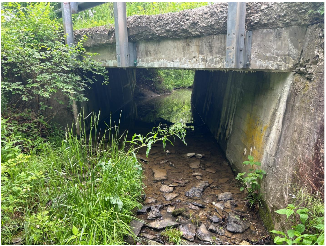
Figure 3. Concentration of limestone floaters in Willow Creek below Plum Creek Road